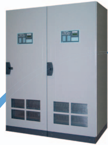
System configuration example