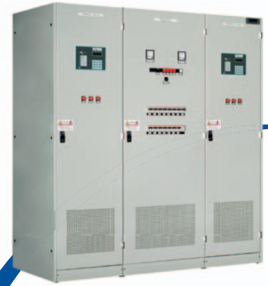
System configuration example